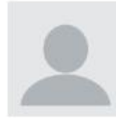
Representative (To Be Announced) NJ Department of Community Affairs